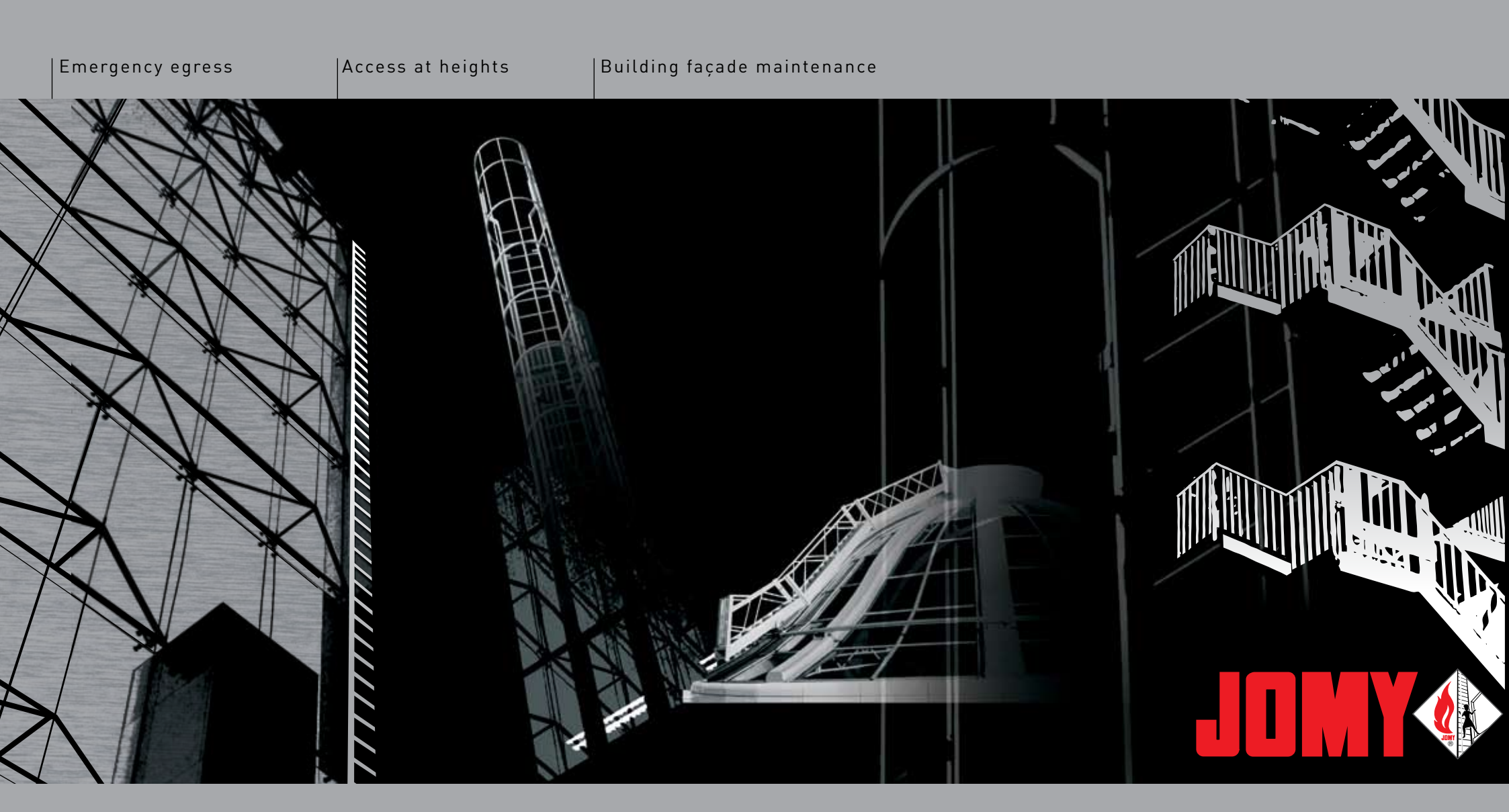
ALUMINUM CONSTRUCTIONS FOR YOUR SAFETY